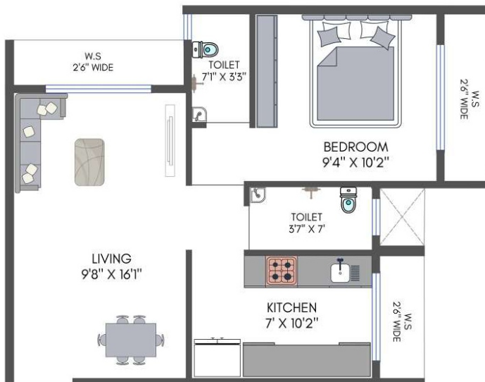
1 BHK LAYOUT TYPE A