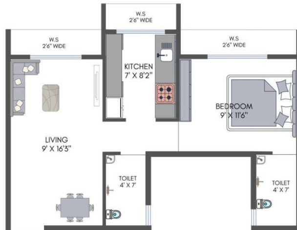
1 BHK LAYOUT TYPE B